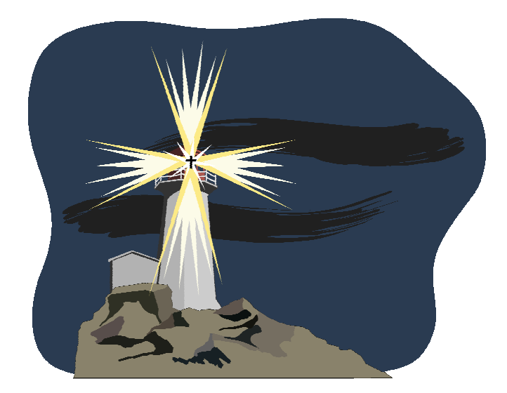
Lighthouse Bible Church